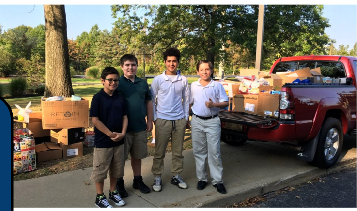
Thank you WECP (Willoughby-Eastlake Classified Professionals) and students for collecting 25 cases of dental supplies for the hurricane victims!

Students at the School of Innovation donated 1,500 items of food to the Lake County RSVP food drive.